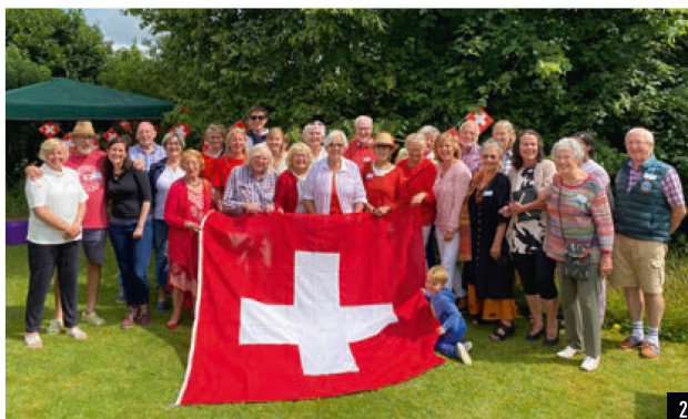
The Taunton and Somerset Swiss Club remains a very happy and lively group of Swiss nationals of all ages.