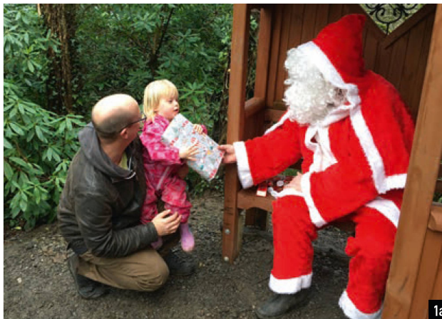
Kids super excited to meet Samichlaus in the wood!