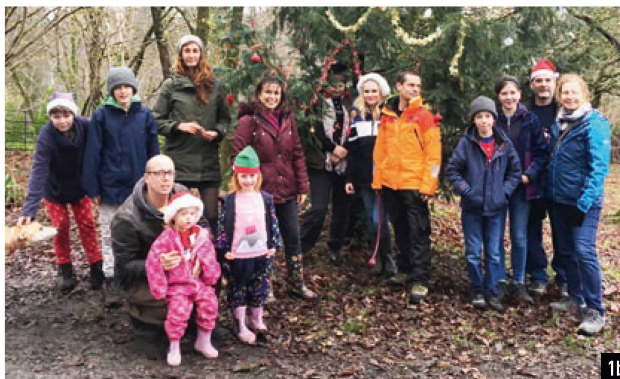
This event in the nature turned out for everyone to be much funnier than holding it indoors.