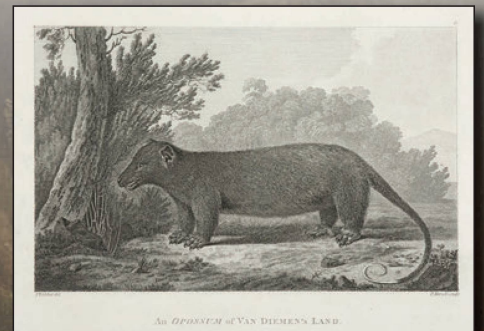
John Webber: Sketch of a possum, Tasmania, 1777. State Library of Tasmania

Sources: Museum of New Zealand; Dictionary of Canadian Biography