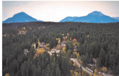
Edelweiss Village - Aerial View

Golden is an ideal starting point for mountaineering expeditions - the town is surrounded by the Columbia and Rocky Mountains, and it is centrally located in relative proximity to no less than six Canadian National Parks: Banff, Glacier, Jasper, Kootenay, Mount Revelstoke, and Yoho.