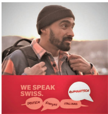
Snook © Tanja N. Maikoff | Infographie © DFAE