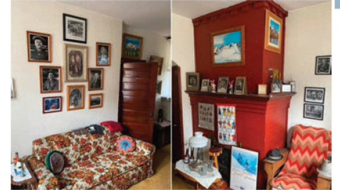
Edelweiss Village - Interior Views

housing for the Swiss allowed the guides to relocate their families to the Village in Golden and dispense with the yearly commute.