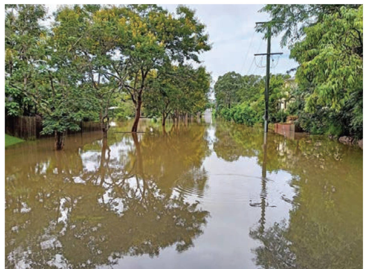
...was transformed into a river within two hours!