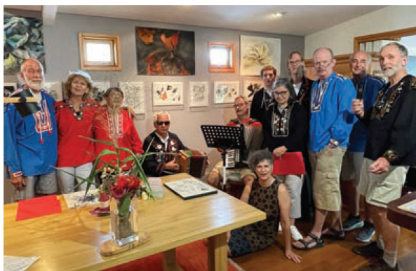
Yodel Choir &amp; Folklore Group 'Baerg-Roeseli' in Brisbane...