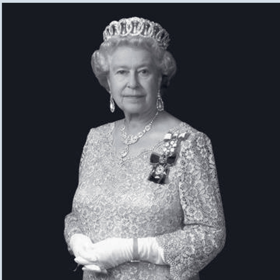
The Queen passed away on the 8 th of September 2022.