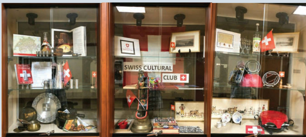
The Swiss Cultural Club at Cedar Crest Village in New Jersey is showcasing our Swiss history and traditions to educate our fellow residents that we Swiss are more than chocolate, cheese, and brown cows.