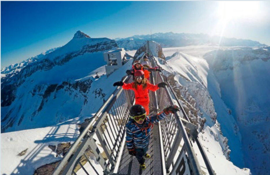
Crossing the 'Peak Walk' – the famous suspension bridge connecting two mountain peaks. One of many unique holiday camp memories.

Children from around Switzerland aged 13 and 14 will attend a week-long snow sports camp in Lenk in the Bernese Oberland from 2 to 8 January 2023. Lots will be drawn to allocate 600 places on the camp, including 25 spots for Swiss Abroad.