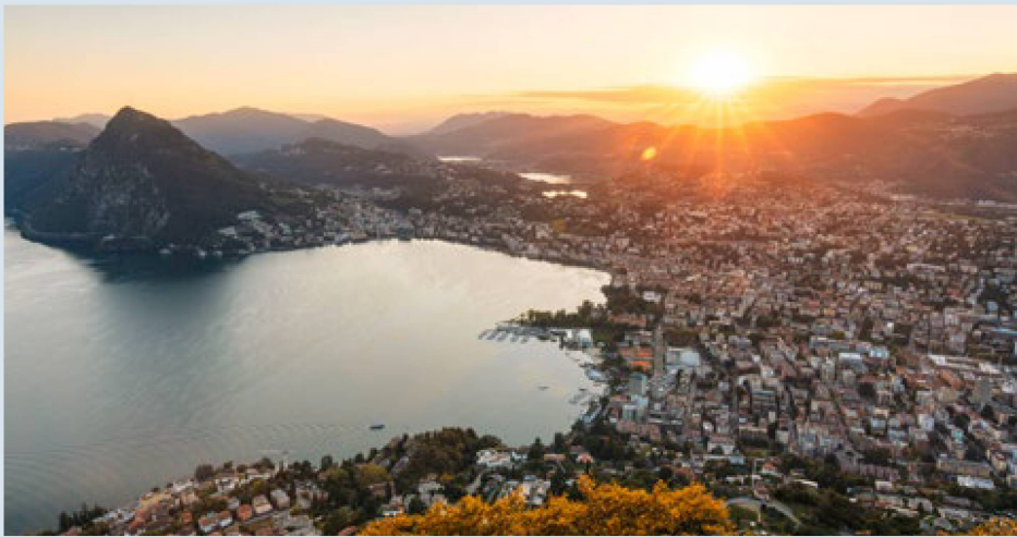
Sunset over the lake – Lugano is an attractive venue.

Register now to secure your participation at the 98th Congress of the Swiss Abroad from 19 to 21 August 2022 in the unique city of Lugano: swisscommunity.link/congress .