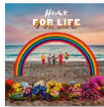
HECHT: "Hecht for Life" Gadget, 2022

Forever young, with loud colours everywhere and cheerful music to match. Eye and ear-catching band Hecht rule the Swiss German dialect scene at the moment. Four years on from their successful and most recent album "Oh Boy", the Lucerne combo are now back with a chart-topping record that mainly appeals to young listeners. The quintet will round off their current tour with a performance at Zurich Hallenstadion in November.