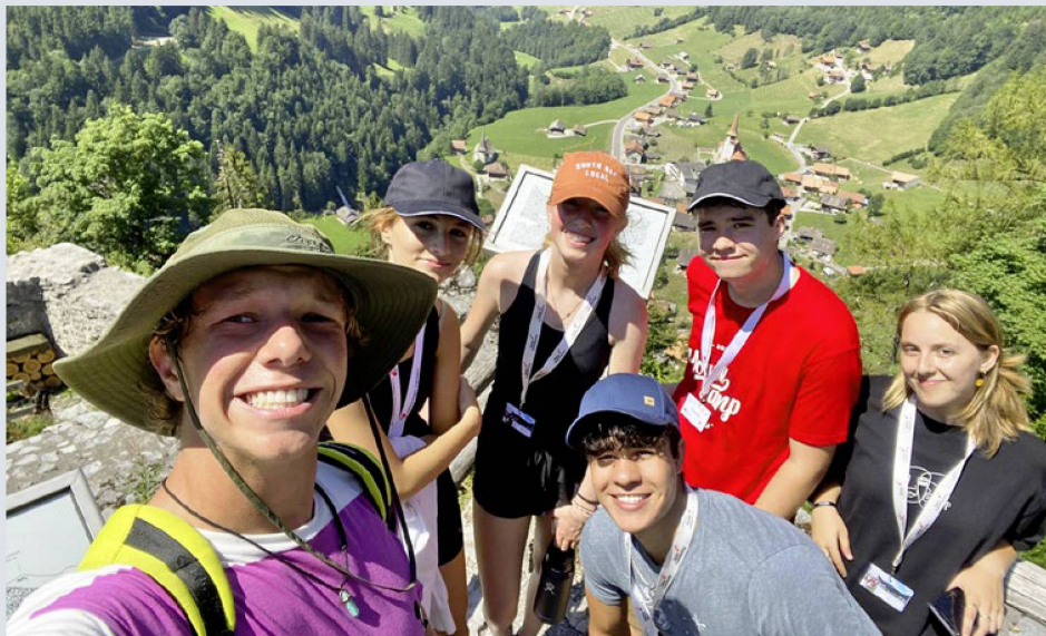
The view's even better from up here.

With the wonderful memories of this year's summer camp still fresh in our minds, we at the Youth Service of the Organisation of the Swiss Abroad (OSA) are now preparing the events for the coming year. This much is already clear: we are delighted to announce that holiday camps will once again be held in Switzerland, together with the Online Congress, in collaboration with the Youth Parliament of the Swiss Abroad (YPSA).