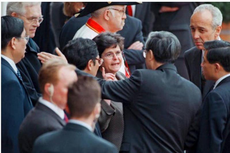
Then the visit quickly turned sour, with Jiang accusing Dreifuss of “being unable to control her people” – the protesters outside. The Swiss president stood her ground and brought up China’s human rights situation.