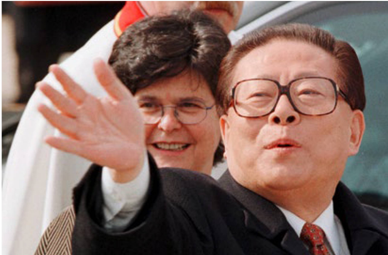
The Swiss President Ruth Dreifuss greets her Chinese counterpart Jiang Zemin at Geneva Airport in 1999. Everything was going well.