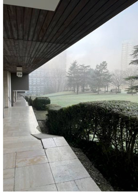
Such an immense building – even under a misty shroud.