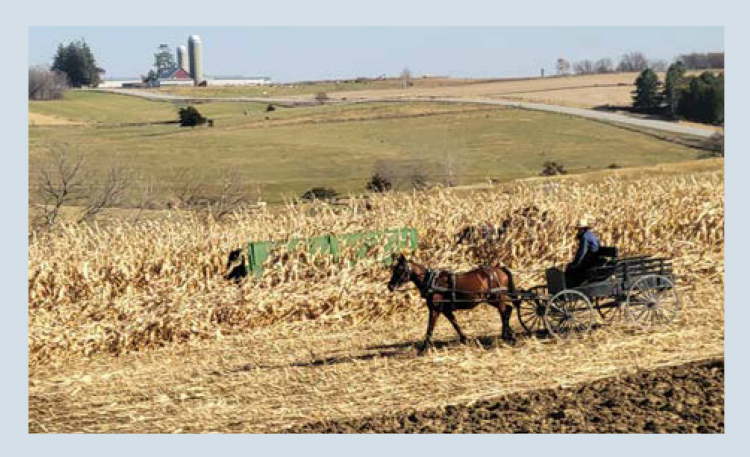
The Amish way the corn is harvested is very different from how modern farmers do it. A horse is pulling a cart through the cornfield while the Amish farmer uses a sickle to cut the cob and throw it onto the wagon. Another farmer uses a horse with a tiller to turn over the soil.

Before we were back at our starting point in Harmony, we stopped at an Amish furniture store and a bakery. That is an experience everyone should have as it brings you a different view of what can be done with what nature provides.