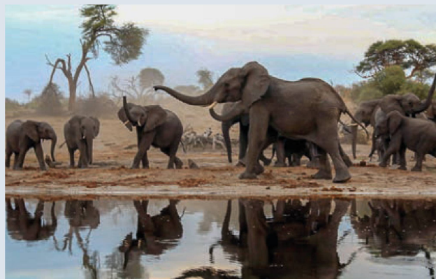
Artificial Intelligence is used to identify sounds of elephants.

The data is sent automatically via the mobile phone network to a computer server where it is crunched and analysed. The "Smart Mic" can precisely identify a wolf call with an accuracy of 500 metres. The device should save game wardens time and cover larger areas than traditional camera traps. It is also much cheaper; a prototype costs CHF450. The invention has also been successfully