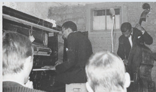
The Dollar Brand Trio at a Cellar Concert in St. Gallen in 1962

ARTICLE: UNIVERSITÄT BASEL, ZENTRUM FÜR AFRIKASTUDIEN