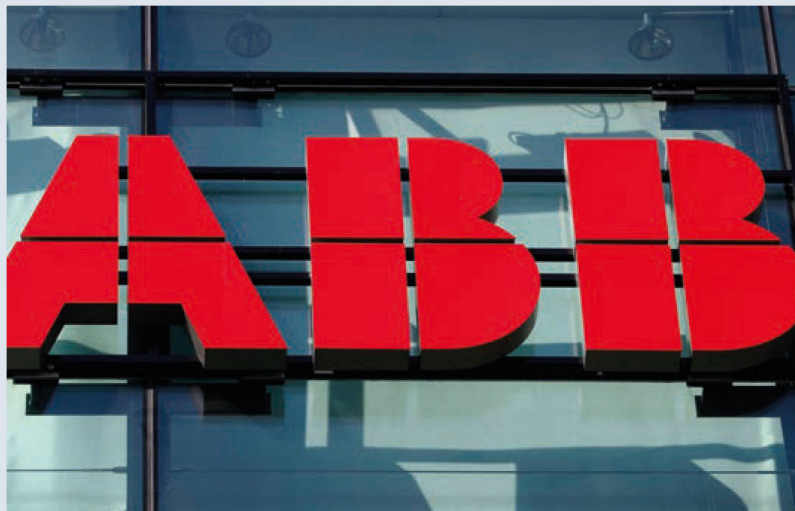
South Africa's National Prosecuting Authority said ABB had agreed to pay punitive reparations to the country.