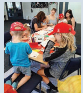
...and on to Hamilton to hand out more goodies.