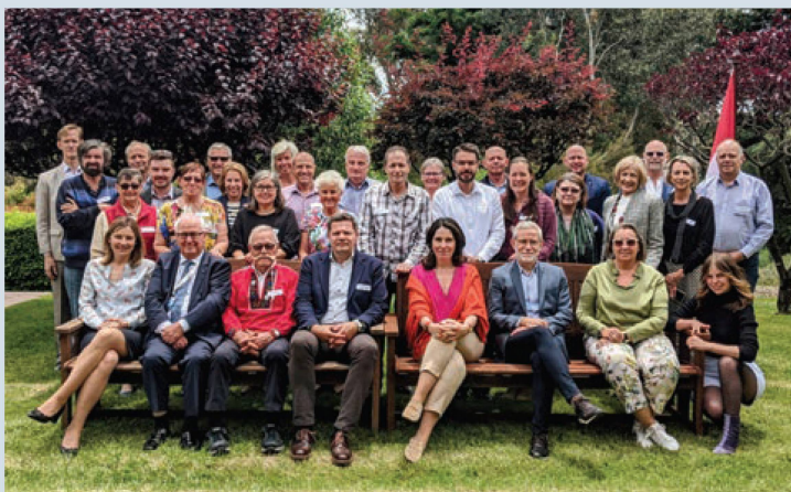
The conference participants from around Australia, New Zealand and Switzerland