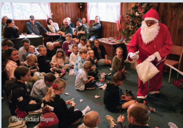
Busy Santa visiting the Taranaki children...

Our Family Christmas Party was held on 4 December at the Newstead School. We were very lucky with the weather as it was a perfect Waikato summer day with blue sky. It was one of the few nice days since end of October. People arrived gradually and a few of the younger children sat down to do some Christmas crafts and decorate gingerbread men, Christmas trees and stars. This is always a lovely activity for the little ones. This year we had only about a dozen children under 10 and a few teenagers but we definitely had a good turnout of adults – young and not so young. Around midday everyone enjoyed the grilled bratwurst and cervelats and a cold drink. After lunch