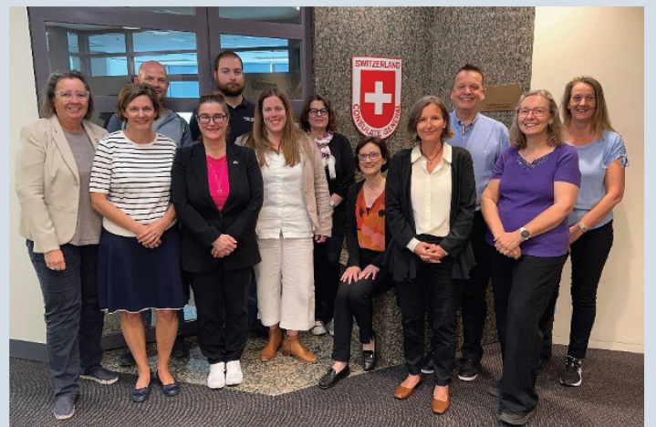
Greetings from the team of the Consulate General in Sydney!

In Australia, Switzerland is today represented by the Embassy in Canberra, which was established in 1961 and celebrated 60 years of diplomatic relations last year, by the Consulate General in Sydney, as well as by the Honorary Consulates in Adelaide, Brisbane, Darwin, Hobart, Melbourne and Perth.