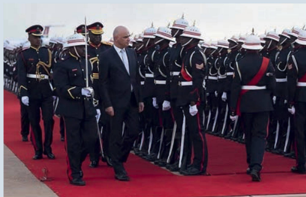
Berset was received with full military honours in Botswana.