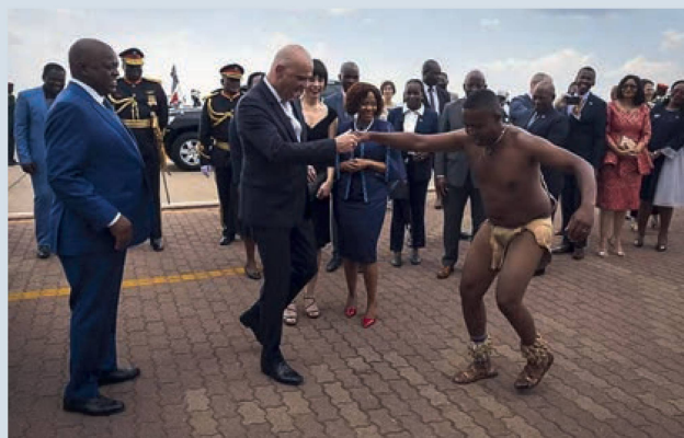
Berset (centre) was invited for a traditional dance during the official welcome ceremony in Botswana. Host Mokgweetsi Masisi (left) looks on.