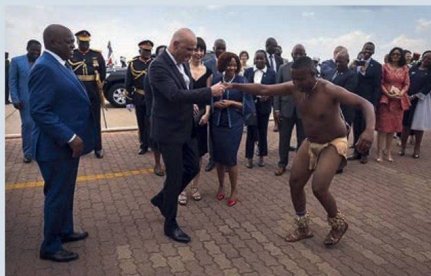
Berset (centre) was invited for a traditional dance during the official welcome ceremony in Botswana. Host Mokgweetsi Masisi (left) looks on.