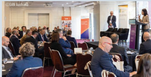
Plenary session at the 'Future of apprenticeship' conference in Melbourne.