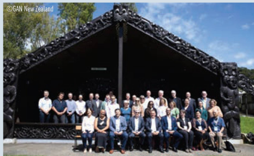
Powhiri (Indigenous Maori welcome ceremony) for the 'Future of apprenticeships' delegates on Waiheke Island near Auckland.

major companies across the Swiss economy, Federal Departments and even the Swiss Confederation – as was the case in 2021 with then President of the Swiss Confederation Guy Parmelin, who started his professional career after his apprenticeship in agriculture. In Switzerland, VET is part of a flexible and permeable education system that ensures everyone has access to further training, higher education, or the possibility to explore career changes throughout their lives. There are no dead ends in the Swiss education system. The Swiss model of apprenticeship is widely considered a success story, and yet, in a fast-changing environment, exchanges amongst experts, trainers and practitioners is necessary to keep up with today's challenges. This led a