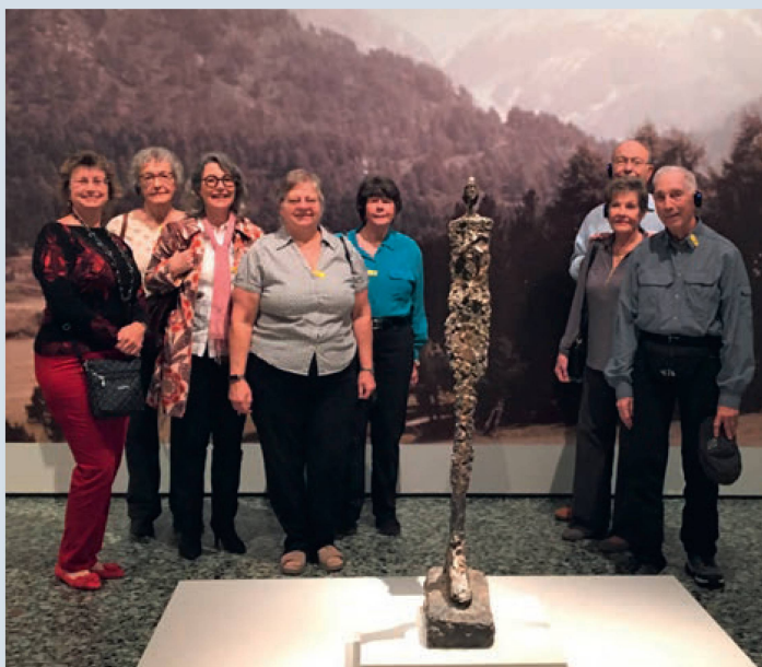
Members visiting the Giacometti Exhibition at the Museum of Fine Arts