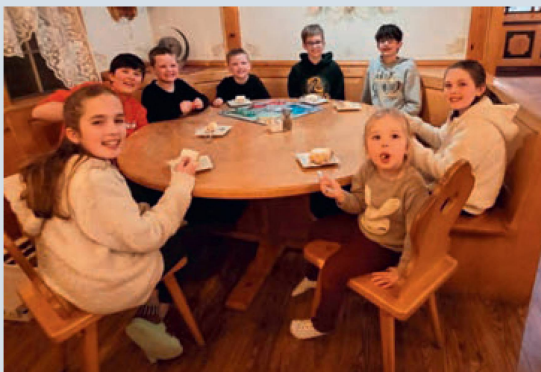
“Young Swiss Stammtisch”