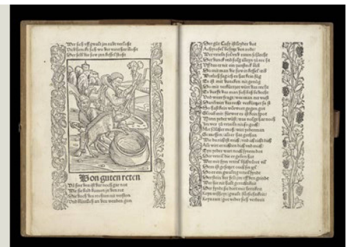
Published in Basel in 1494 and illustrated with woodcuts, "Ship of Fools" by the humanist Sebastian Brant is an allegorical poem satirising the weaknesses and vices of the time.

Rich countries are the "usual suspects" when it comes to plundered art, but Switzerland itself was once the victim of a heist. The Capuchin friars of Fribourg have kept a beady eye on their valuable library for centuries but were evidently looking the other way when one of the books in their safekeeping, the "Ship of Fools" dating from the 15th century, was stolen during the Second World War. This exceptional work, dating back to the early days of the printing press, resurfaced in 1945 at a New York City book dealer. It was later gifted to one of the world's largest libraries, the Library of Congress in Washington. The friars were left empty-handed again in 1975, when a thief posing as a Vatican librarian made off with around 20 valuable old manuscripts. Like "Ship of Fools", these works disappeared and were forgotten – until the beginning of the 2000s, when an employee of the Fribourg Cantonal and University Library (KUB) found out the following: firstly, that the stolen manuscripts had been sold at auctions in Munich in 1975 and 1976, and secondly, that the missing copy of "Ship of Fools" had been lo-