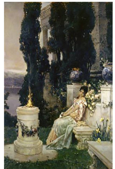
Wilhelm Kotarbinski: At the altar. Undated. Oil on canvas.