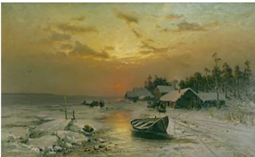
Yuliy Klever (Julius von Klever): Winter sunset. 1885. Oil on canvas