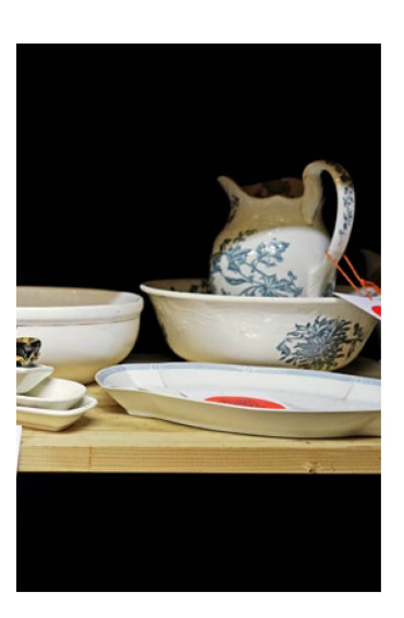
From antique furniture, to traditional textiles, to heirloom crockery everything must go.