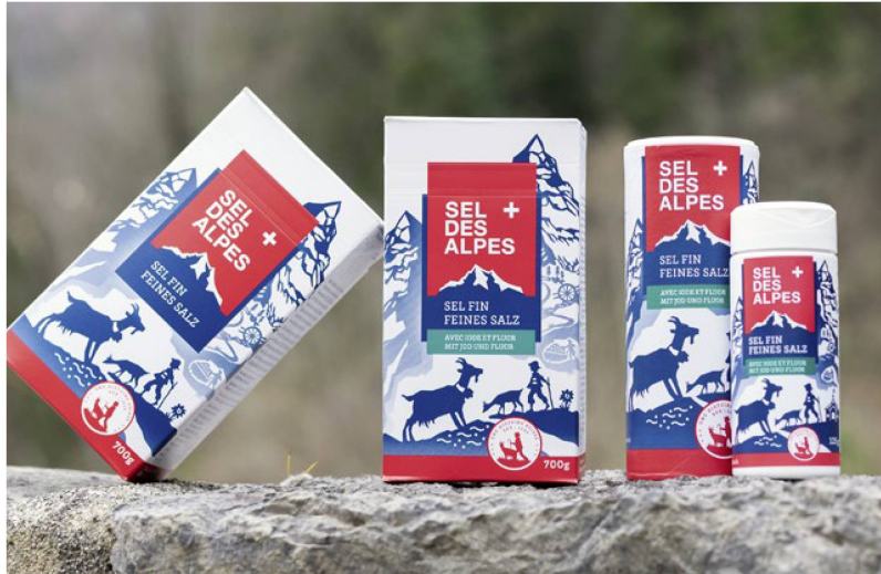
‘Sel des Alpes’ (Salt of the Alps) – provenance is everything in the world of salt.