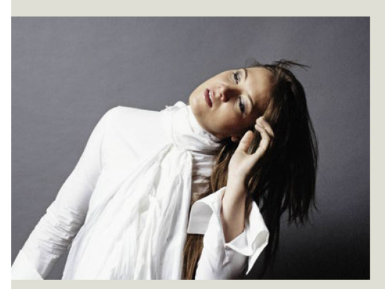
Sophie Hunger.