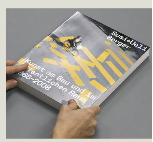
"Art in architecture and public space 1968–2008" by Susi & Ueli Berger – winner of the "Golden Letter" at the 2023 "Best Book Design from all over the World" competition in Leipzig.