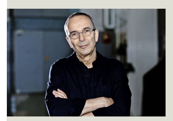
Jossi Wieler, Swiss Grand Award for Theatre/Hans-Reinhart-Ring 2020.