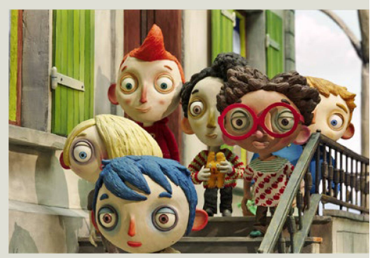
"My Life as a Courgette" won Best Fiction Film at the 2017 Swiss Film Awards and was nominated as best animation at the Oscars.

Through involvement in events, projects and translation work, the Swiss arts council Pro Helvetia helps to showcase Swiss cultural practitioners abroad. This includes funding public presentations, organising promotional events for international hosts, appearing at international exhibitions and networking events (e.g. Venice Biennale and Avignon Theatre Festival), and producing promotional material. The six Pro Helvetia liaison bases in Cairo, Johannesburg, Moscow, New Delhi, Shanghai and South America foster relations with local partners and cultural institutions, act as intermediaries on the ground, and offer residential, research and exchange programmes that allow artists and cultural practitioners from Switzerland to gain a foothold and engage with international audiences.