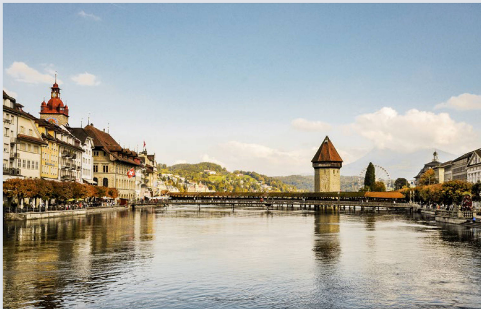
The Chapel Bridge and its water tower – one of the most iconic sights in Lucerne.

The 100th Congress of the Swiss Abroad will take place in the magnificent setting of Lucerne, against the backdrop of Lake Lucerne and the majestic Alpine peaks. And that's not all – we will be celebrating three anniversaries, and enjoying an interesting exchange of ideas.