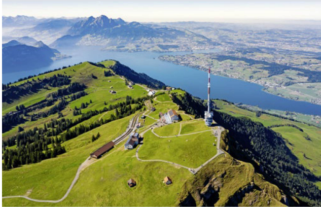
View from the slopes of Mount Pilatus down to Lake Lucerne and the city of Lucerne.

connection to our homeland which is reflected in the spirit of unity among the Swiss wherever they may live.