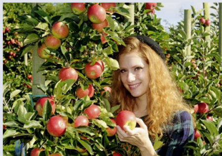
An enormous range characterizes the 245 professions for which apprenticeships are offered in Switzerland – from arboriculturist ...

An apprenticeship lasts three or four years, depending on the profession. Those who complete their apprenticeship and gain the Federal VET Diploma are well prepared for