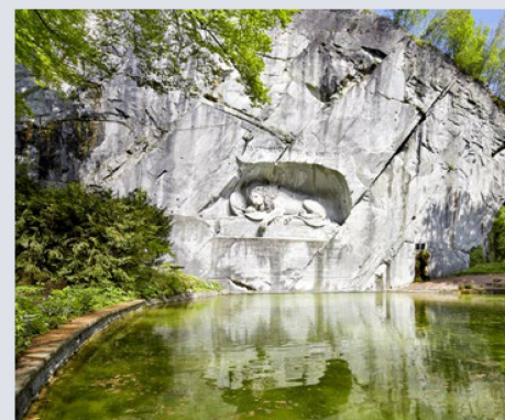
The Lion Monument commemorates the Swiss Guards who fell during the Storming of the Tuileries in Paris in 1792.

The 100th Congress of the Swiss Abroad will be a memorable occasion. It will address the past, present and future of the Swiss diaspora and will enable us to celebrate this