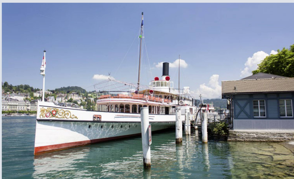
Boats are a common sight in Lucerne – vintage paddle steamer “Uri”, moored at Bahnhofquai.