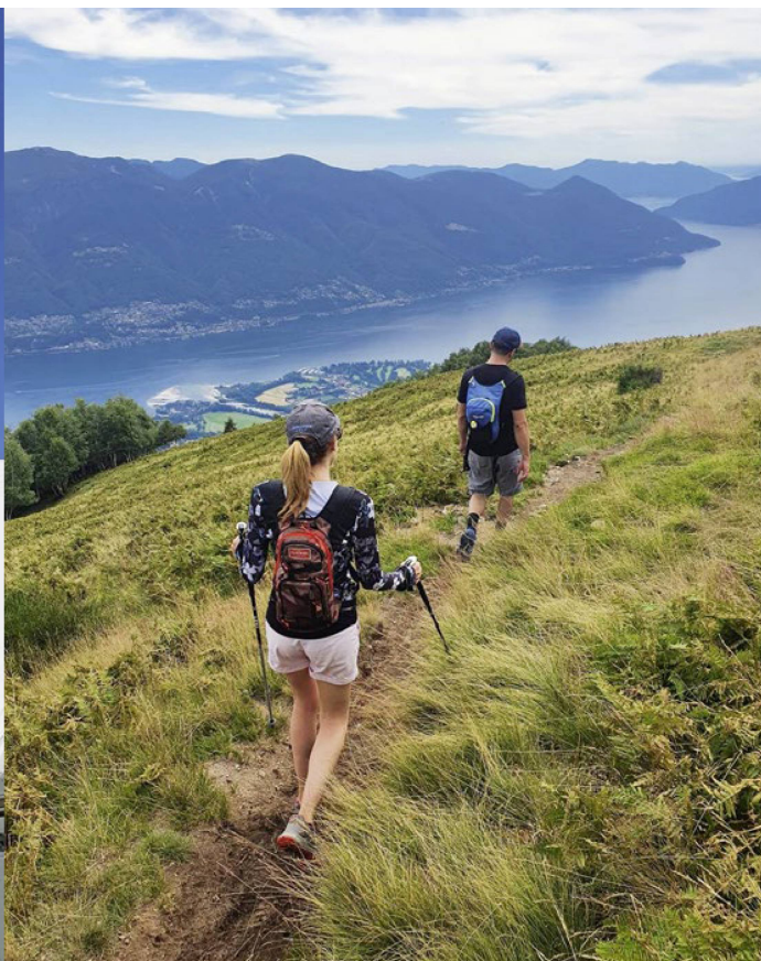
From ski resort to hiking destination – nearly all the ski lifts at Cardada-Cimetta have been dismantled.

Switzerland has around 260 automatic monitoring stations like the one at Locarno-Monti. This ground-based network goes by the name of SwissMetNet.