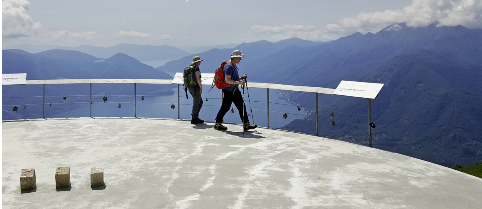
Cardada-Cimetta, the mountain overlooking Locarno, receives an average of 2,256 hours of sunshine each year. It was formed as a result of a collision between the European and African continental plates.

No other place in Switzerland receives more hours of sunshine than Cardada-Cimetta above Locarno. This lofty location is a centre of solar research.