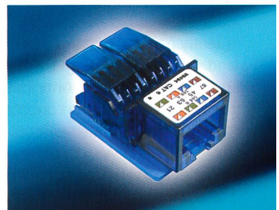
Original Cat. 6 Anschlussmodul von R&M