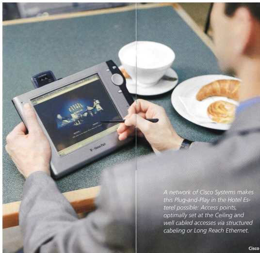
A network of Cisco Systems makes this Plug-and-Play in the Hotel Estrel possible. Access points, optimally set at the Ceiling and well cabled accesses via structured cabling or Long Reach Ethernet.

In order to access the service, the user requires an 802.11 enabled laptop, using either a WIFI card, like a network card with an antenna, or on-board 802.11 that is beginning to proliferate (see Intel's Centrino product, and Dell's recent announcement that all latitude laptops will come with 802.11 as standard, as examples – all other major manufacturers have similar programmes). Usually, access will be on a subscription basis, or via a prepaid scratch card or credit card account. Authentication is most often based on the RADIUS (Remote Authentication Dial-in User Service) standard, using a username and password. There are at present thousands of hotspots around the world, and these are increasing at a rate of knots. Aside from the often referenced hotels, cafes and convention centres, 802.11 is facilitating broadband access in many other locations, such as around phone booths in the United Kingdom, and even an outdoor public plaza in Australia.