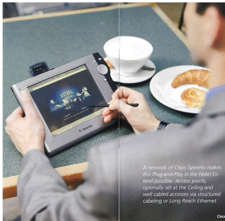
A network of Cisco Systems makes this Plug-and-Play in the Hotel Estrel possible: Access points, optimally set at the Ceiling and well cabled accesses via structured cabling or Long Reach Ethernet.

In order to access the service, the user requires an 802.11 enabled laptop, using either a WIFI card, like a network card with an antenna, or on-board 802.11 that is beginning to proliferate (see Intel's Centrino product, and Dell's recent announcement that all latitude laptops will come with 802.11 as standard, as examples – all other major manufacturers have similar programmes). Usually, access will be on a subscription basis, or via a prepaid scratch card or credit card account. Authentication is most often based on the RADIUS (Remote Authentication Dial-in User Service) standard, using a username and password. There are at present thousands of hotspots around the world, and these are increasing at a rate of knots. Aside from the often referenced hotels, cafes and convention centres, 802.11 is facilitating broadband access in many other locations, such as around phone booths in the United Kingdom, and even an outdoor public plaza in Australia.