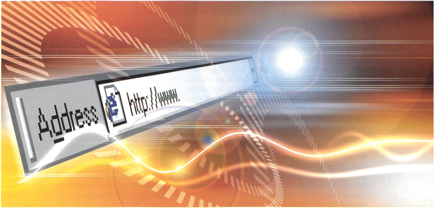
Fig. 1. To be connected to the Internet, any computer or other device must have a unique IP address assigned to it.

The Internet Protocol (IP) address system is part of the underlying infrastructure of the Internet. To be connected to the Internet, any computer or other device must have a unique IP address assigned to it.