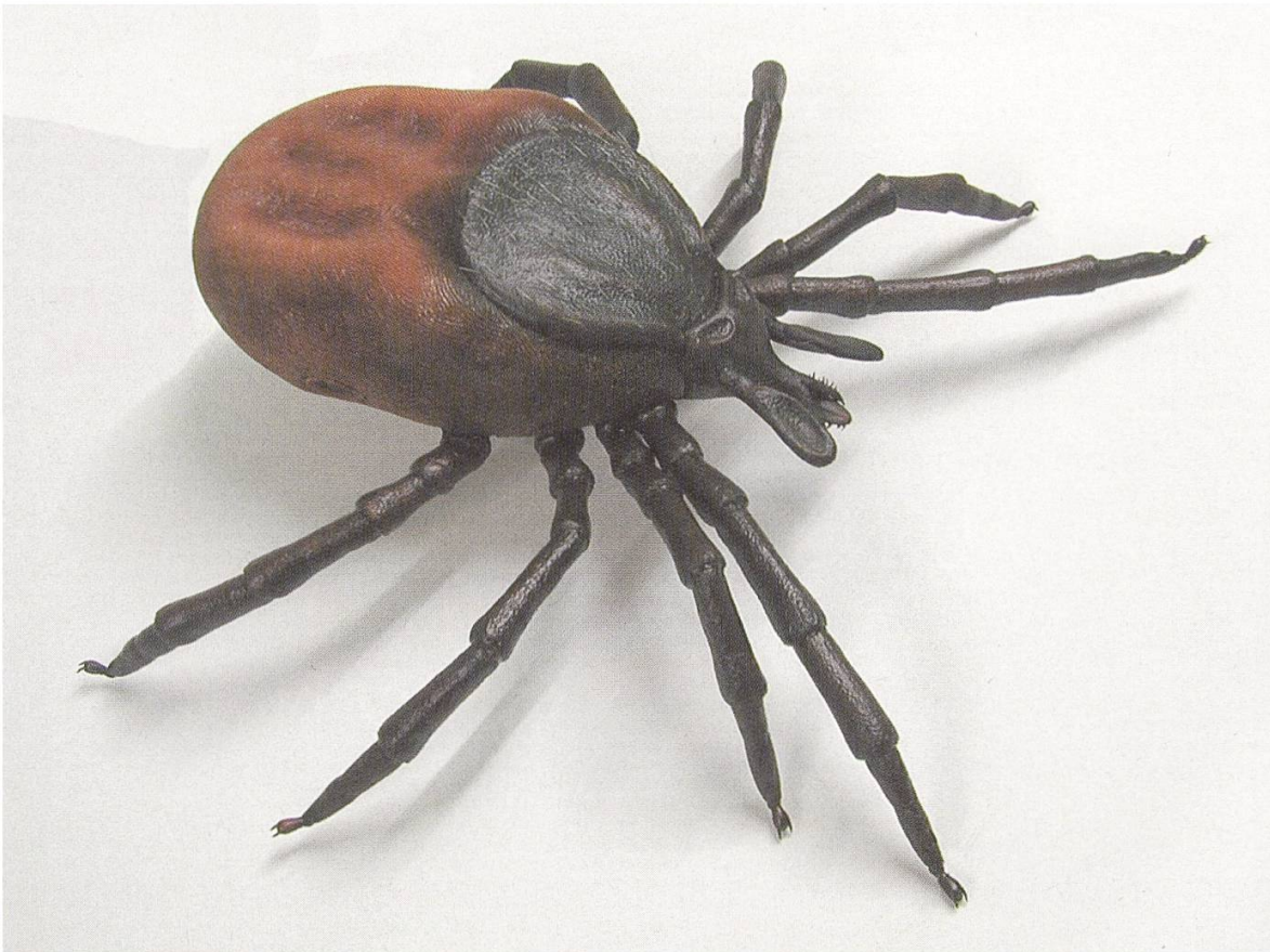
Fig. 4. Model of a tick nymph, made by Johannes Rauch.