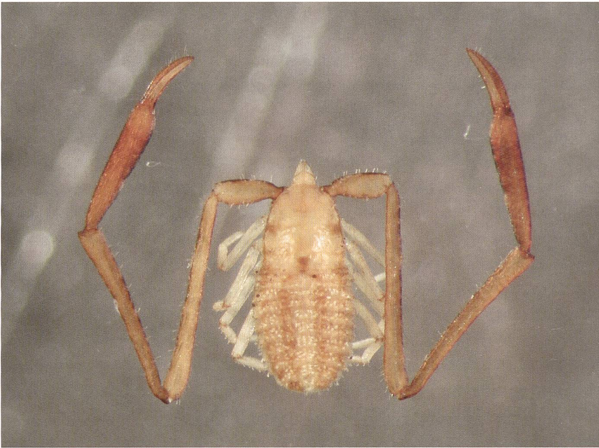
Fig. 1. Habitus of Attaleachernes thaleri gen. nov., sp. nov. (photo Berit Hansen, Plön).