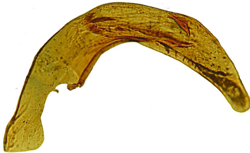
Fig. 5a, b: Asioreicheia chinensis (BULIRSCH, MAGRINI & JIA, 2013) a: Median lobe of aedeagus, ventral view; b: apical part of median lobe, ventral view.