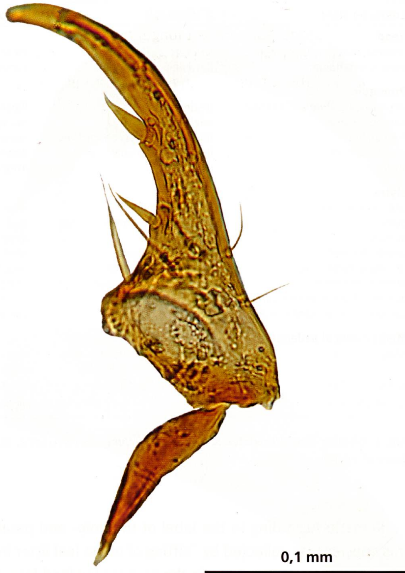
Fig. 4: Asioreicheia guenardi sp. nov., paratype female, left coxostylus, dorsal view.

However, during the last ice age the sea receded for 50 km (B. Guénard, personal communication), and we have to assume that during this period this channel would have been a deep river. Heishiding National Reserve (the record of A. chinensis ) is located between the He, Xi, and Bei river. All the rivers to the west of and including the Xi and Bei river sections are deeply cut rivers and will not have moved in 100,000's of years except for the point where the Xi meets the Bei which is on the Pearl river flood plain. The Pearl delta rivers are all massive, and there are a lot of them. But as they are on a flood plain, they will have all moved back and forth. So, it is supposed to be unlikely for a flightless terricol species to extend its distribution across these barriers and the delta.