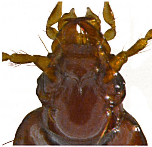
Fig. 2: Asioreicheia guenardi sp. nov., holotype, male, head with mouthparts, dorsal view.

Elytra: Moderately convex on disc, distinctly convex in basal third (lateral view). Outline regularly long-oval, maximum width at middle, margined from pedunculus to apex; margin serrate up to apical third, teeth of serration sharp basally, becoming indistinct apically; base nearly straight, with fine and smooth reflexed margin; humeral angle visible, obtuse; lateral channel broad from level of humerus to apex, narrow at middle, with fold-like carina near apex crossing lateral channel, with broad setigerous tubercles; setae robust, long. Suture at base somewhat impressed. Basal granula absent; basal setigerous puncture with distinct tubercle, situated in projected extension of first interval. No scutellar stria. Striae 1–3 consisting of partly connected punctures, 1–5 reaching base but not up to basal declivity, all becoming less impressed towards apex and laterally. First interval slightly to moderately convex, others flattened. Interval 3 with 10–12 and interval 5 with 7–8 fine setigerous punctures, located with nearly equal distance to each other but with irregular distance to striae, setae pili-like, short, fine, upright.