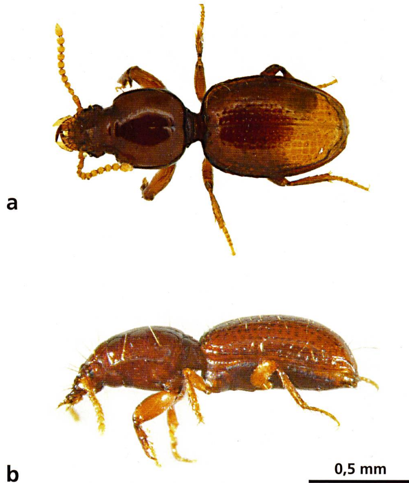
Figs. 1a, b: Asioreicheia guenardi sp. nov., holotype, male, a: dorsal view, b: lateral view.

with transverse rugae, median tooth not extending over lateral lobes; ligula with moderately long seta; antenna moderately long, extending up to posterior setigerous puncture of pronotum, scapus about as long as pedicellus, with one dorsoapical seta, third segment 1.5 times longer than wide, segments 4–10 moniliform, fully pubescent from segment 4 onwards.