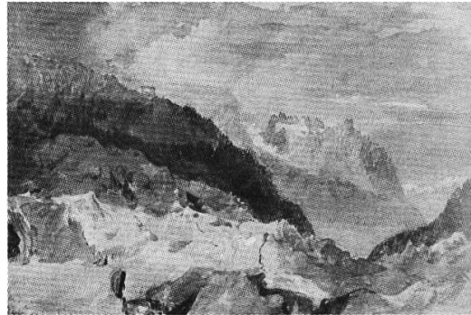
III. 6 Turner, Mer de glace, Chamonix (1802)

Let us turn in conclusion to his travelling companion in this infernal alpine region, his future wife Mary Wollstonecraft Godwin, who was carrying with her the manuscript of her first novel, Frankenstein or The Modern Prometheus . There she undermined the omnipotence of the divine Creator by allowing the scientist Dr. Victor Frankenstein to create an artificial human being. His creature is a synthetic product of the laboratory, of the "workshop of filthy creation", and comes into the world untainted by any sexual origin. The alternative to "filthy creation" in Frankenstein is the frozen purity of Mont Blanc and the "fertile fields" that lie below in the valley of Servox. Mary Shelley even distinguishes this