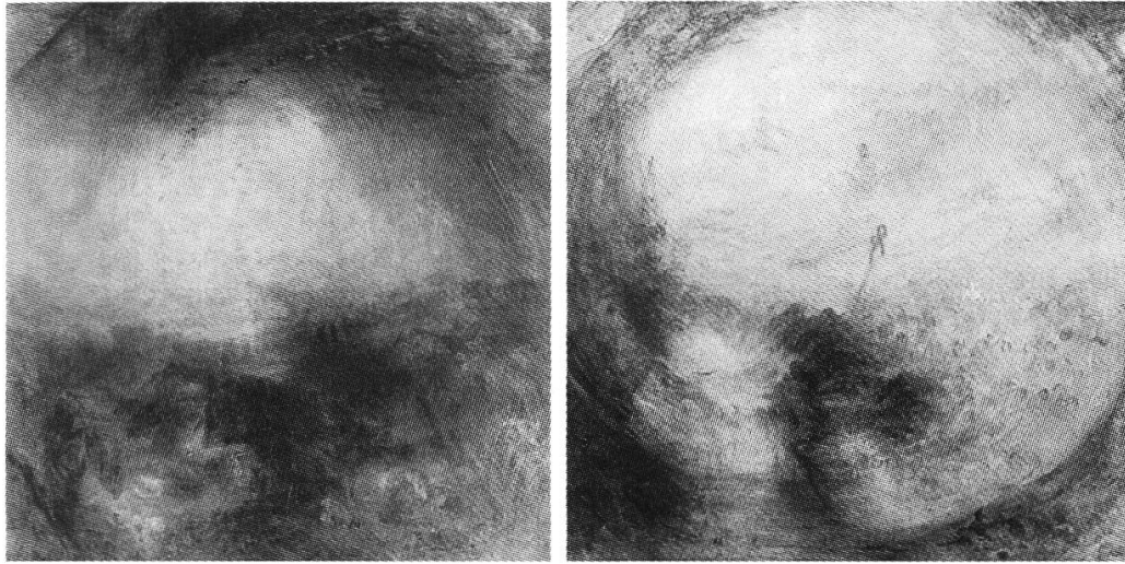
Ill. 3 Turner, Shade and Darkness – the Evening of the Deluge (1843) Ill. 4 Turner, Light and Colour (Goethe's Theory) – the Morning after the Deluge – Moses writing the Book of Genesis (1843)

The titles alone make a clear claim, even to a theoretical grounding in Goethe's Farbenlehre . We notice too the apocalyptic scope of these paintings, the overwhelming of human beings, animals, and buildings by sublime power. Burke's theory of the sublime underlies all of Turner's alpine and apocalyptic paintings. In his Enquiry Burke describes the ocean as "an object of no small terror" and Turner's dissolution of structure and order enacts Burke's theory that dark and confused images "have a greater power on the fancy to form the grander passions than those have which are more clear and determinate". 14 The vortex swirls around a centre of light that exemplifies Burke's view of the sun as a radiant and even blinding force, as what Milton called "darkness visible", and to Turner the sun-vortex is a figure of revolution. Even here the sublime is translated into political theory, and Burke in 1790 himself accuses the French revolutionaries of creating "this new conquering empire of light and