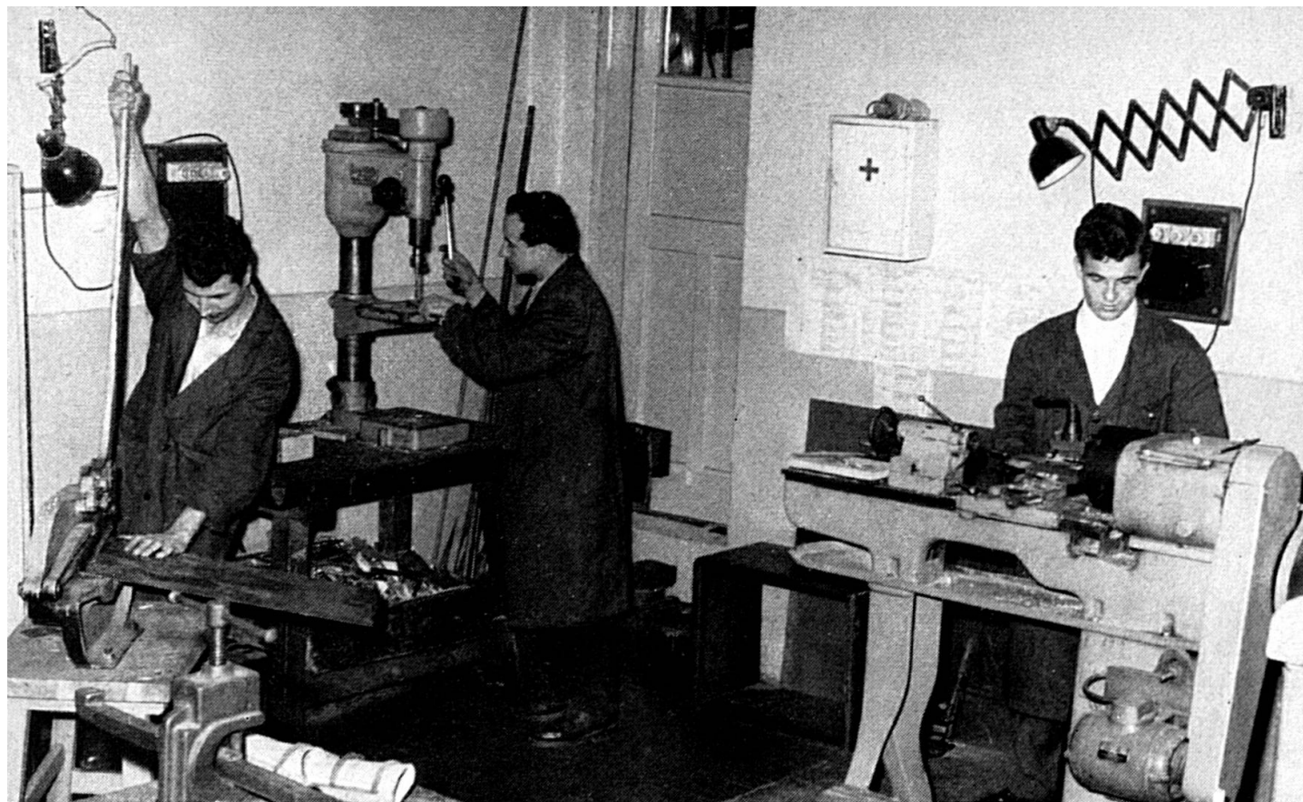
YUGOSLAVIA The artificial limb workshop in Sarajevo.