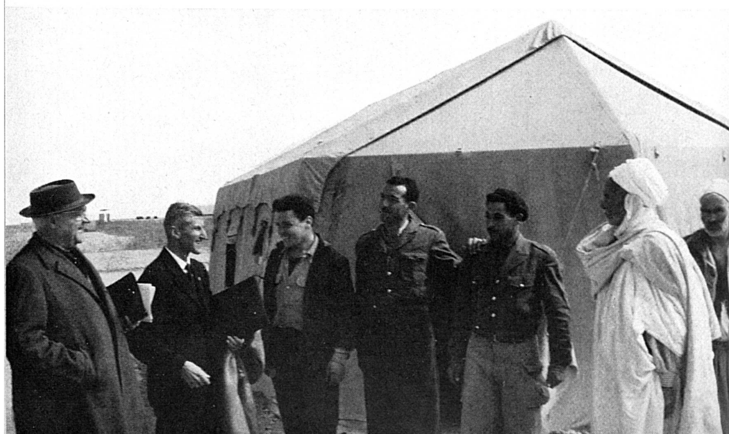
ALGERIA The screening and transit centre in Barika.