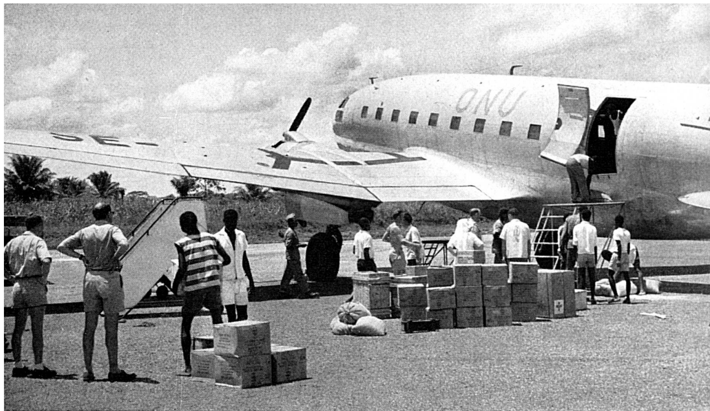
CONGO Foodstuffs and medical supplies for the hospital at Gemena being unloaded from a United Nations aircraft placed at the disposal of the ICRC and accompanied by a delegate.