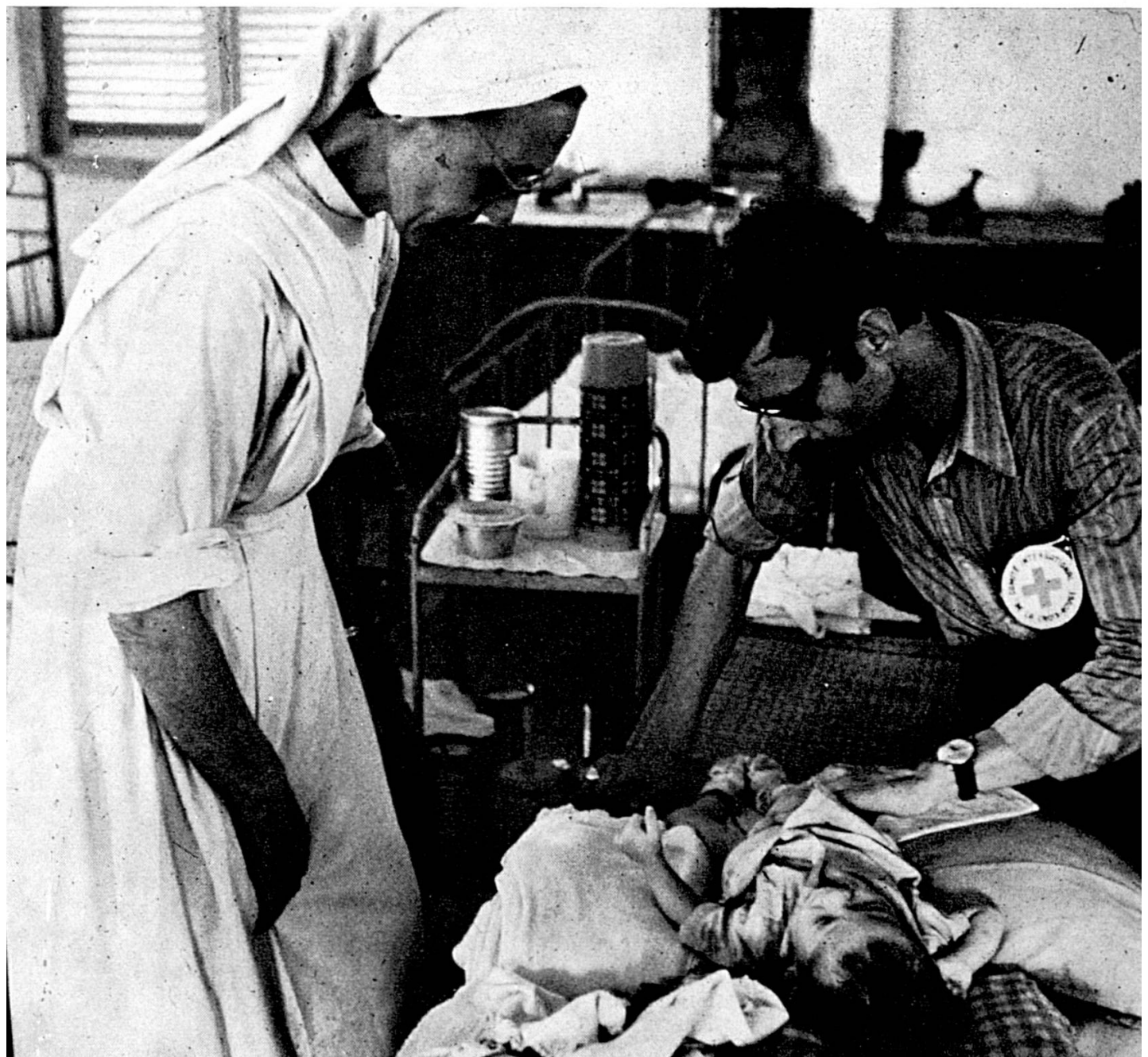
An ICRC doctor-delegate visiting a Saigon orphanage.