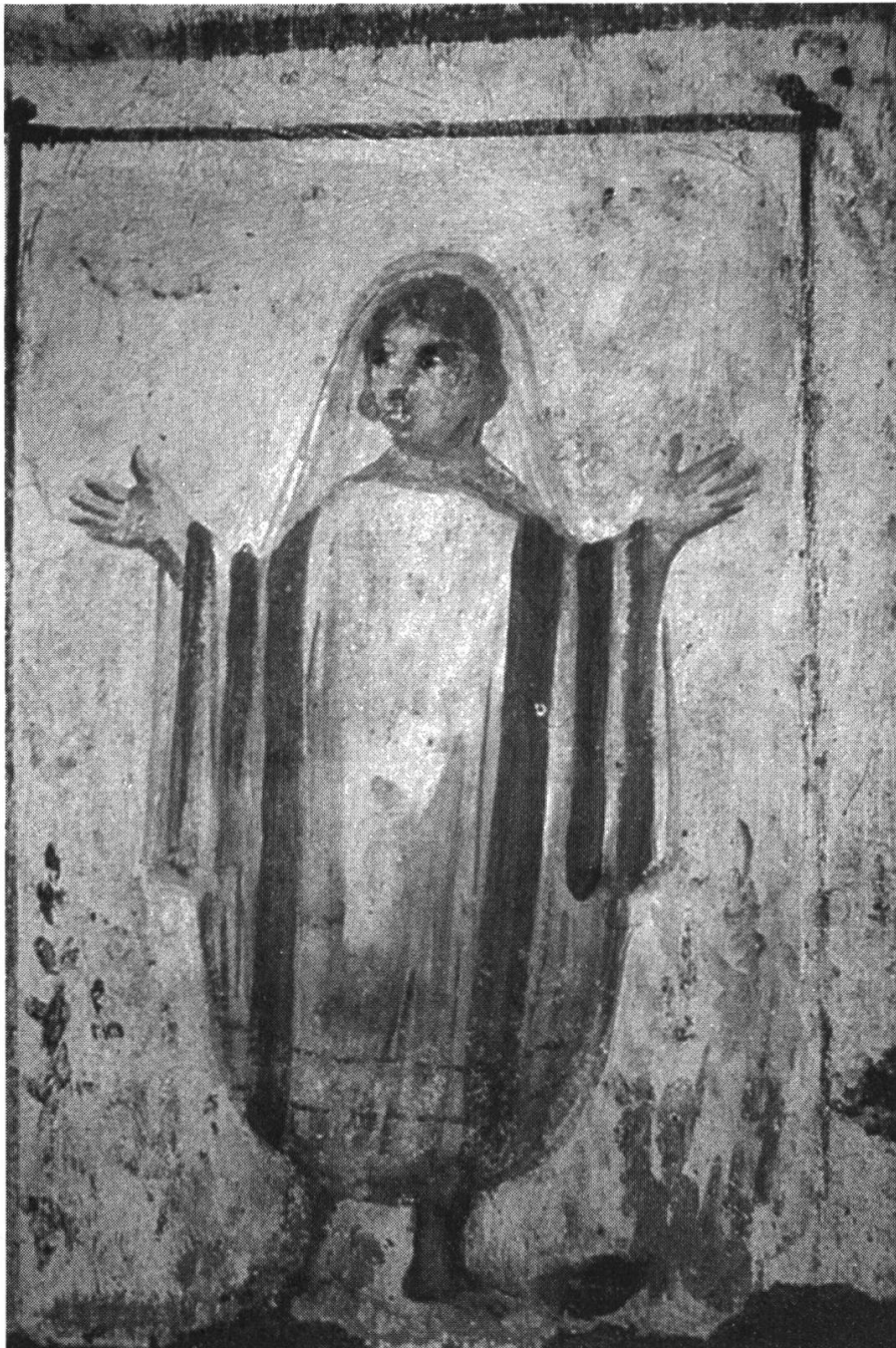
Figure 2. Orans, IVth cent. (Rome, Via Latina Catacomb)