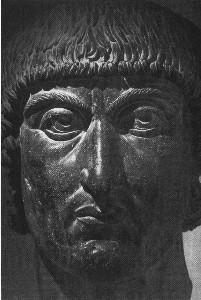
Figure 3. Head of Constantine the Great, IVth cent. (Rome, Musei Capitolini)