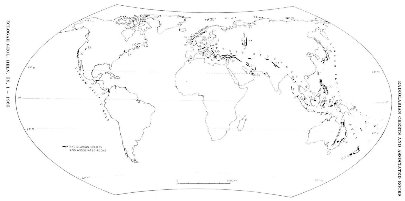
Fig. 1. Geographic distribution of radiolarian cherts and associated rocks.