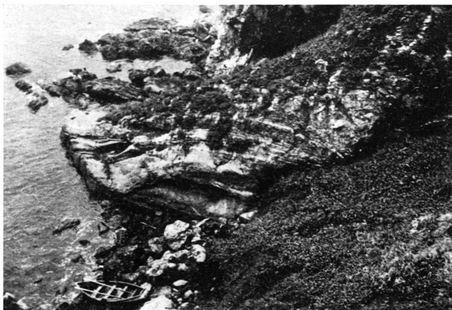
Fig. 5. Landing place with orbitoidal limestone (B-3) of Bed 10.

Bed 10 is built up mainly of layers of grey glauconitic orbitoid marlstone with intercalated softer marls. The lowest 4 meters are composed almost entirely of the tests of orbitoids and colonies of calcareous algae ( Lithothamnium s.l.), fine brecciated rubble of the same material and echinoids. Typical of the lower part are the samples Rz.251, J.S.1024, K.903, K.1500 (all in square B-3 of the map).