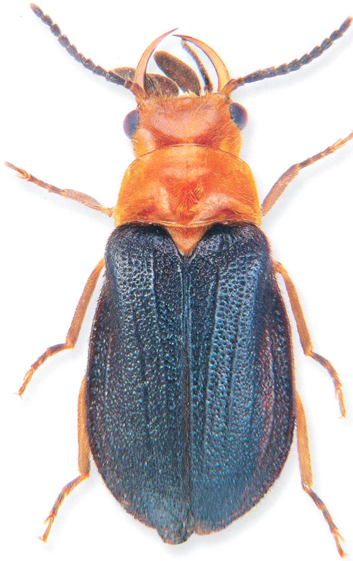
Fig. 1. Lamellipalpus constantini sp.nov.: habitus (photo Robert Constantin).

Pronotum testaceous, strongly transverse, depressed posteriorly before angles. Posterior angles protruding. Entire surface shining with small punctures, each with a long and very fine seta. Scutellum small, triangular and testaceous.