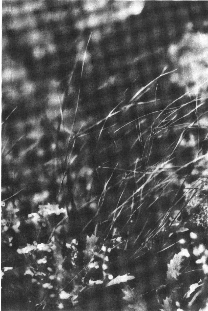
Figure 2. Juncus trifidus subsp. carolinianus ( Saxifraga michauxii in the left). North Carolina, Blue Ridge Mts., Craggy Garden (apparently the type locality), August 1978.

all the examined specimens can be included in subsp. carolinianus rather than subsp. trifidus , though some of them are not very typical. The question, whether any of the Canadian J. trifidus are fully identical with subsp. trifidus , needs further study, as will the exact location of the northern limit of subsp. carolinianus .