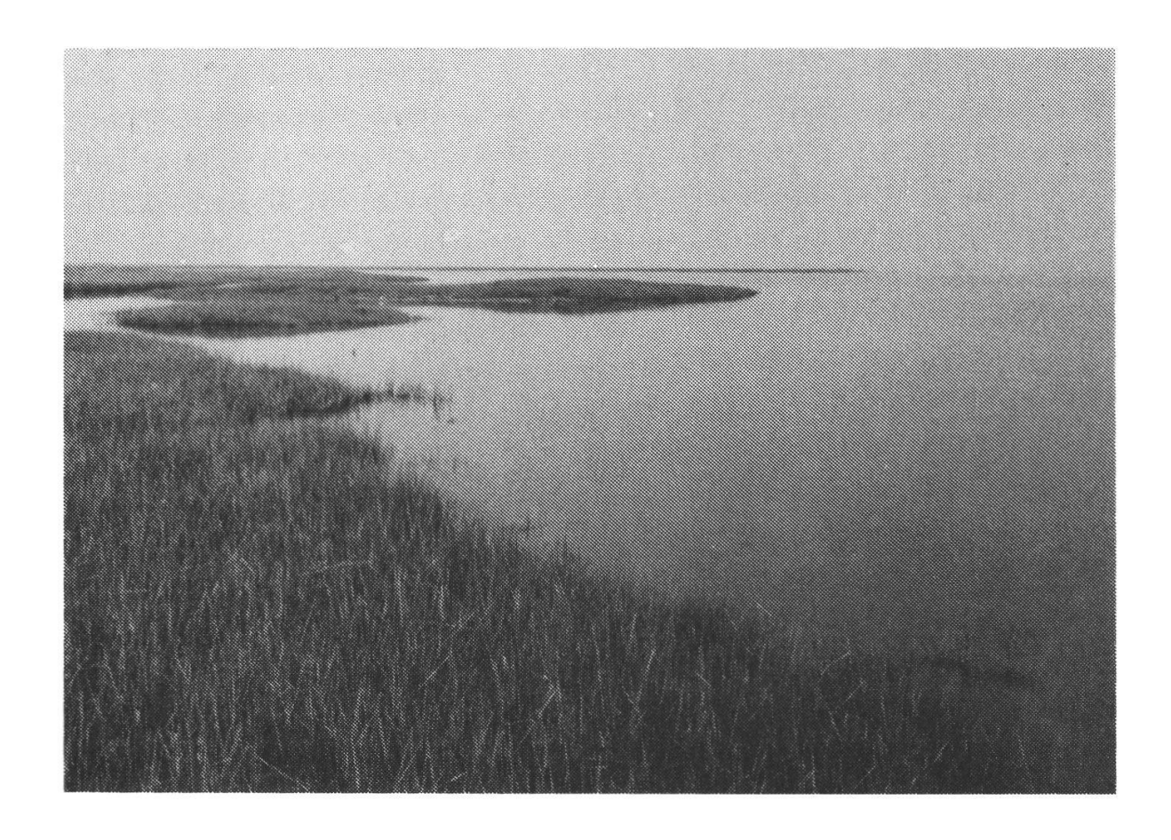
Figure 4. Salt marsh along the Pamlico Sound estuary, Ocracoke Island, Cape Hatteras National Seashore, North Carolina - June 1979.

without exception these marshes exhibit an erosional scarp along their low side bordering the estuary. GODFREY (1976) noted that "although salt marshes can form behind barrier beaches in four ways: invasion of uplands as the sea level rises, sediment buildup from river outflow, ocean overwash, and inlet