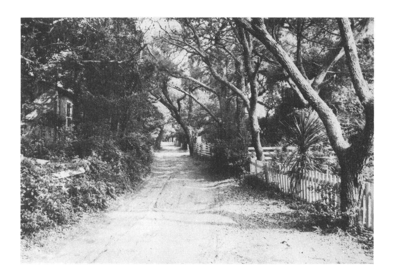
Figure 3. Howard Street in Ocracoke Village, Ocracoke Island, North Carolina - June 1979.

Vegetation of the sand flats on Core Banks has been described by DOLAN et al.