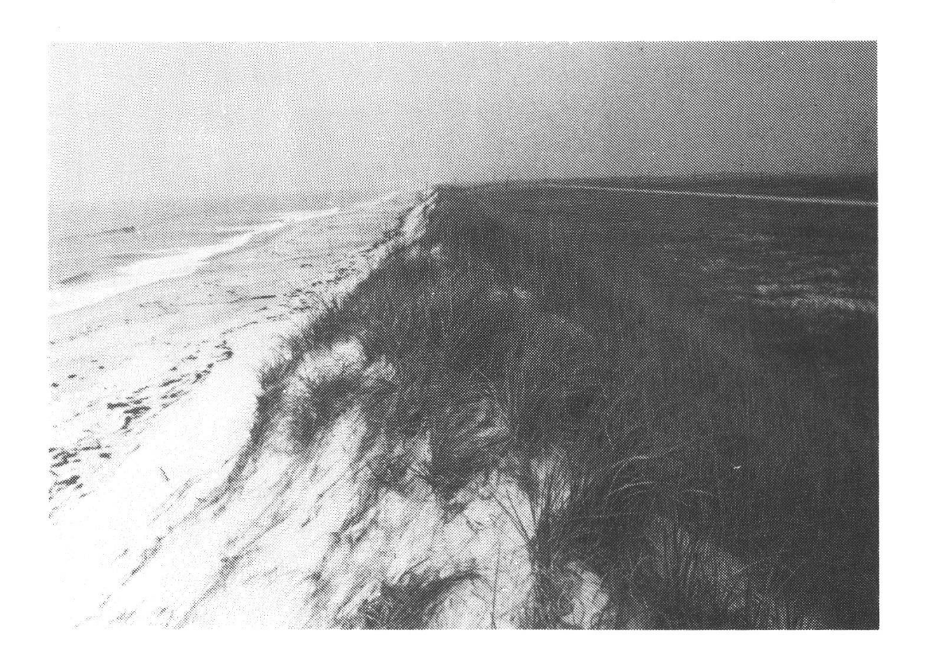
Figure 1. Beach strand and artificial barrier island dune ridge within Cape Hatteras National Seashore, Ocracoke, North Carolina - June 1979.

Older dunes are more stable, exhibit greater floristic diversity and have more pronounced zonation. Characteristic plants of the more stable dune, in addition to those mentioned above, often exhibit various xeromorphic adapta-