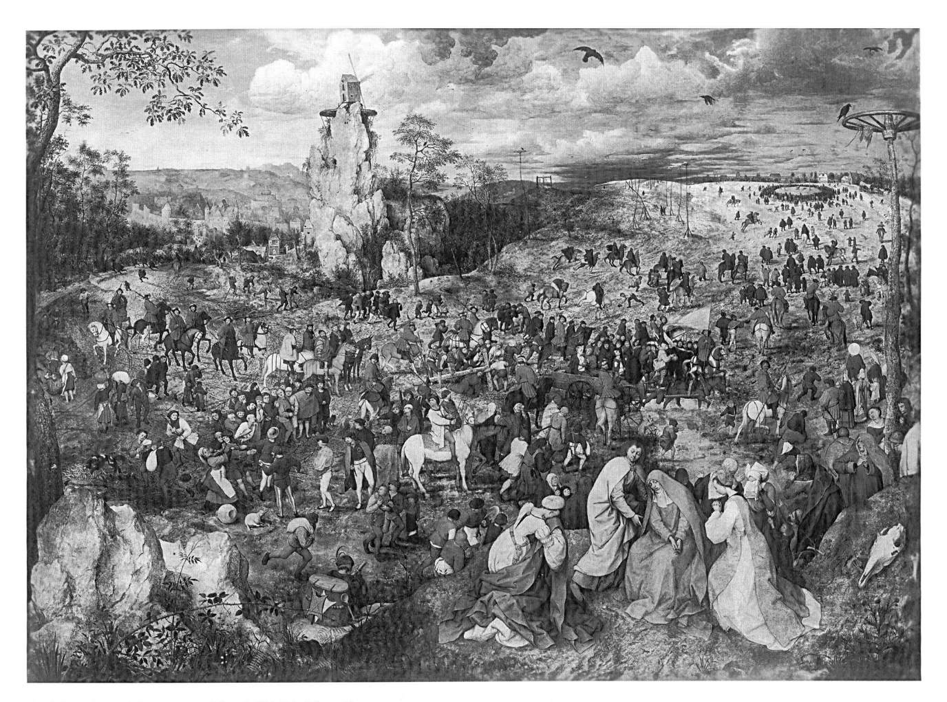
Fig. 2: Pieter Bruegel, "Procession to Calvary", 1564, 124 x 170 cm, Vienna, Kunsthistorisches Museum. \,