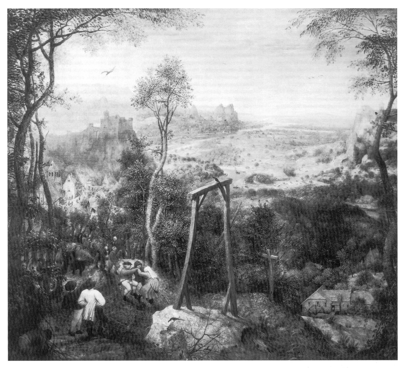
Fig. 1: Pieter Bruegel, "Magpie on the Gallows", 1568, 45,9 x 50,8 cm, Darmstadt, Hessisches Landesmuseum.