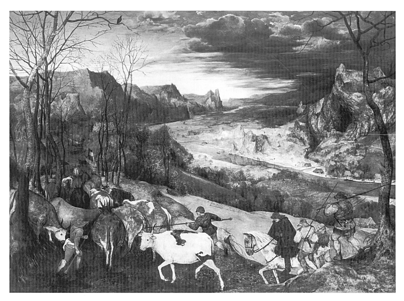
Fig. 5: Pieter Bruegel, "Return of the Herd", 1565, 117 \times 159 \text{ cm} , Vienna, Kunsthistorisches Museum.

quickening river, these well-muscled drovers drive the herd toward the safety of shelter before the onslaught of the gathering storm. Black clouds amass above the hills on the right, darkening the fields on the far side of the river and providing an opposing movement to that of the drovers. Bruegel therefore articulates the coming of winter through the power of nature's physical might, suggesting thereby the seriousness of the late autumn work. Just as "The Harvesters" posits a similarity between the peasants and natural production, "Return of the Herd" delineates the threat of winter in terms of a resemblance between the forces of man and nature. Active and dynamic, the drovers lean into the wind, conveying the impression of a steady forward movement, a movement which duplicates that of the approaching storm.