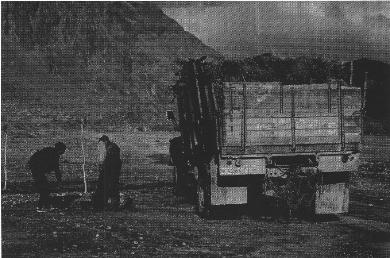
Fig. 3: Transition in Central Asia leads to a disruption of economic and social systems, with serious consequences for natural resources. Collection of rare wood biomass in high pasture areas as a substitute for fossil fuel is a focus of study by the Institute in the Pamir Mountains of Tajikistan.

Moderne Transformationsprozesse in Zentralasien führen zu einer Spaltung der ökonomischen und sozialen Systeme mit ernstzunehmenden Folgen für die natürlichen Ressourcen. Die Brennholzproblematik in Hochlagen des Pamir-Gebirges in Tadschikistan ist ein Untersuchungsschwerpunkt des Institutes.