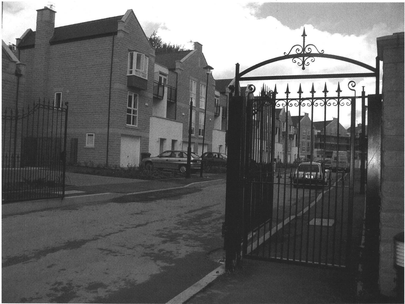
Photo 2: Newly built houses, and access gate Des immeubles nouveaux et une barrière d'entrée Neue Gebäude und eine Einfahrt mit Zugangsbeschränkung