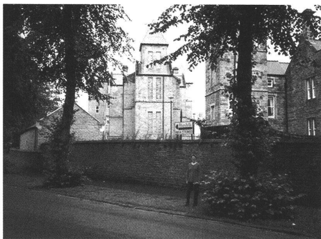
Photo 1: The original workhouse buildings and the surrounding stone wall

Les bâtiments originaux d'indigents, entourés d'un mur de pierre