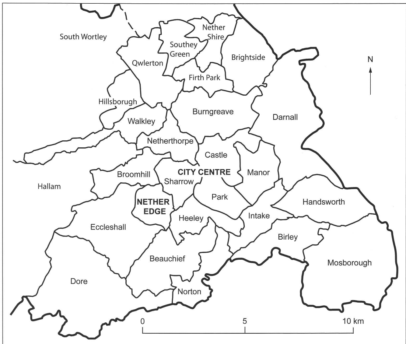
Fig 1: The boundaries of Sheffield local government wards

Les circonscriptions électorales locales à Sheffield