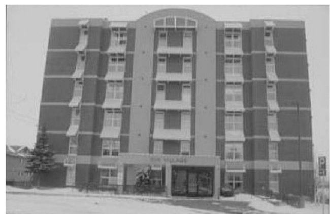
Fig. 3: Non-profit housing Logements sans but lucratif Gemeinnütziger Wohnungsbau

result of market demand, and those that are still mixed buildings including some seniors. Low-income families living in private apartments receive a provincial housing allowance that was established in 1993. Brandon (BRANDON ECONOMIC DEVELOPMENT BOARD 2003) reports that low-income households living in private rental accommodation typically pay rent that is $ 134 per month more than 30 percent of their income. They are forced to either use the food and clothing portion of their provincial allowances on rent, or to move to accommodations that are below the standards adequate for their family needs, such as boarding houses or low-end hotel accommodation.