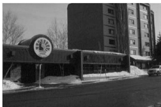
Fig. 2: Public housing unit with seniors' centre attached Logements sociaux joutés d'un centre pour seniors Sozialwohnungen mit angeschlossnem Seniorenzentrum

b) Non-Profit Housing in Brandon is provided by seven organizations and a co-operative housing unit. The units are primarily for persons over 55 although