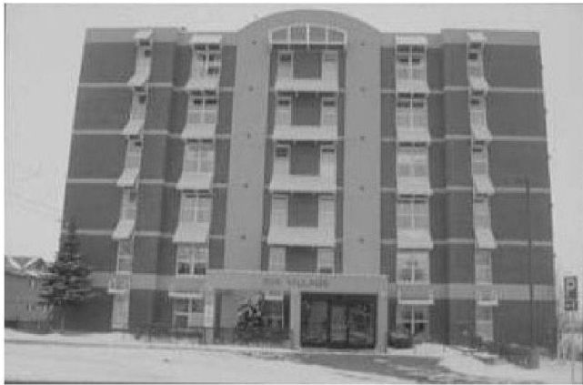
Fig. 3: Non-profit housing Logements sans but lucratif Gemeinnütziger Wohnungsbau

result of market demand, and those that are still mixed buildings including some seniors. Low-income families living in private apartments receive a provincial housing allowance that was established in 1993. Brandon (BRANDON ECONOMIC DEVELOPMENT BOARD 2003) reports that low-income households living in private rental accommodation typically pay rent that is $ 134 per month more than 30 percent of their income. They are forced to either use the food and clothing portion of their provincial allowances on rent, or to move to accommodations that are below the standards adequate for their family needs, such as boarding houses or low-end hotel accommodation.