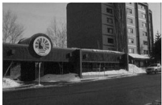
Fig. 2: Public housing unit with seniors' centre attached Logements sociaux joutés d'un centre pour seniors Sozialwohnungen mit angeschlossnem Seniorenzentrum

b) Non-Profit Housing in Brandon is provided by seven organizations and a co-operative housing unit. The units are primarily for persons over 55 although