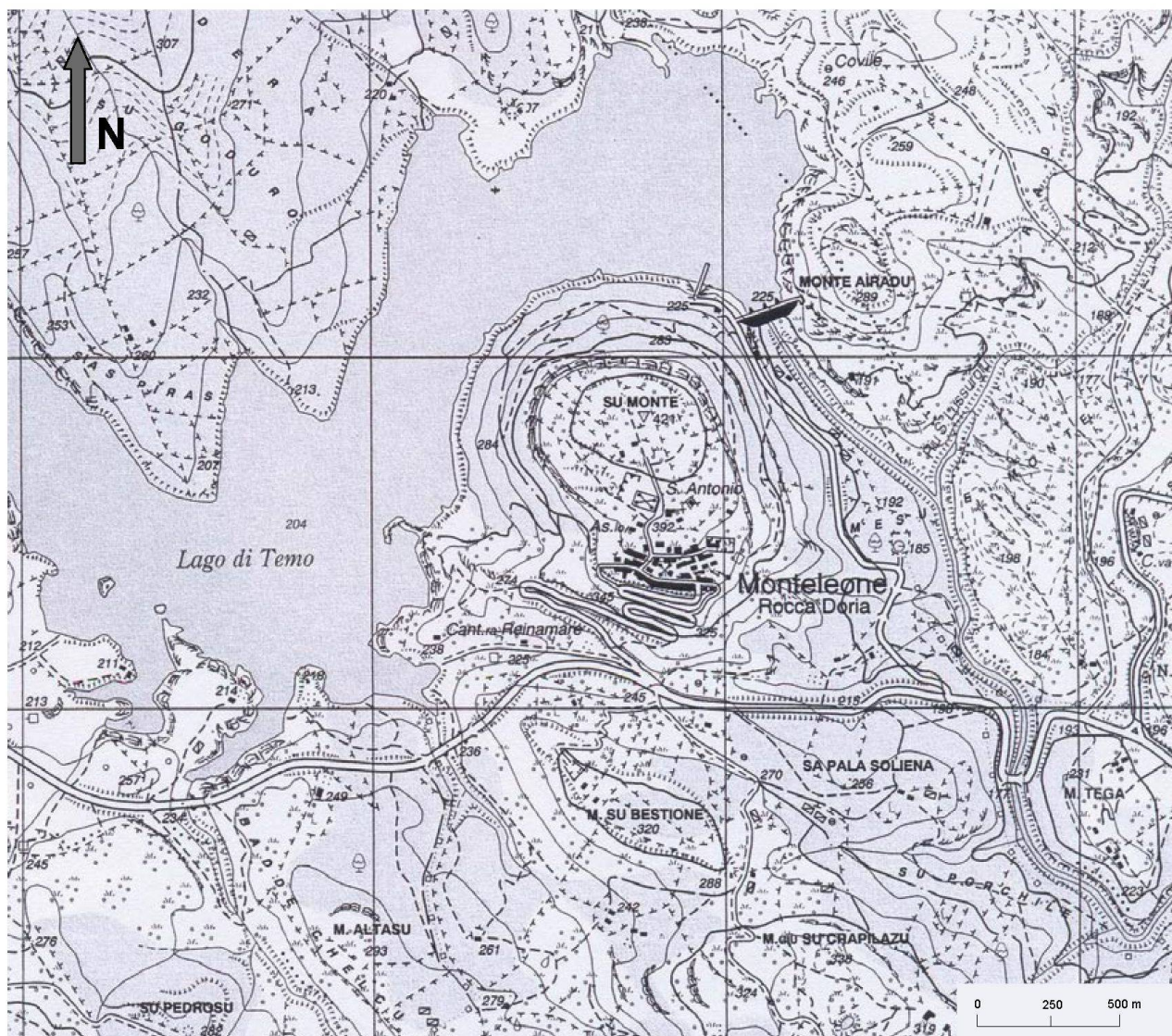
Fig. 2: Monteleone Rocca Doria