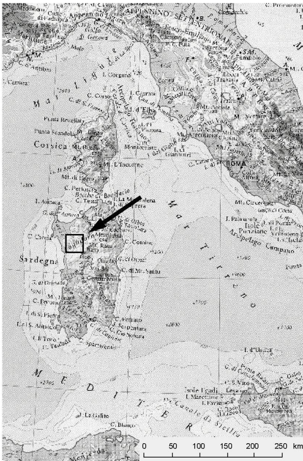
Fig. 1: Location of the study area Lage des untersuchten Gebietes Situation de la zone d'étude