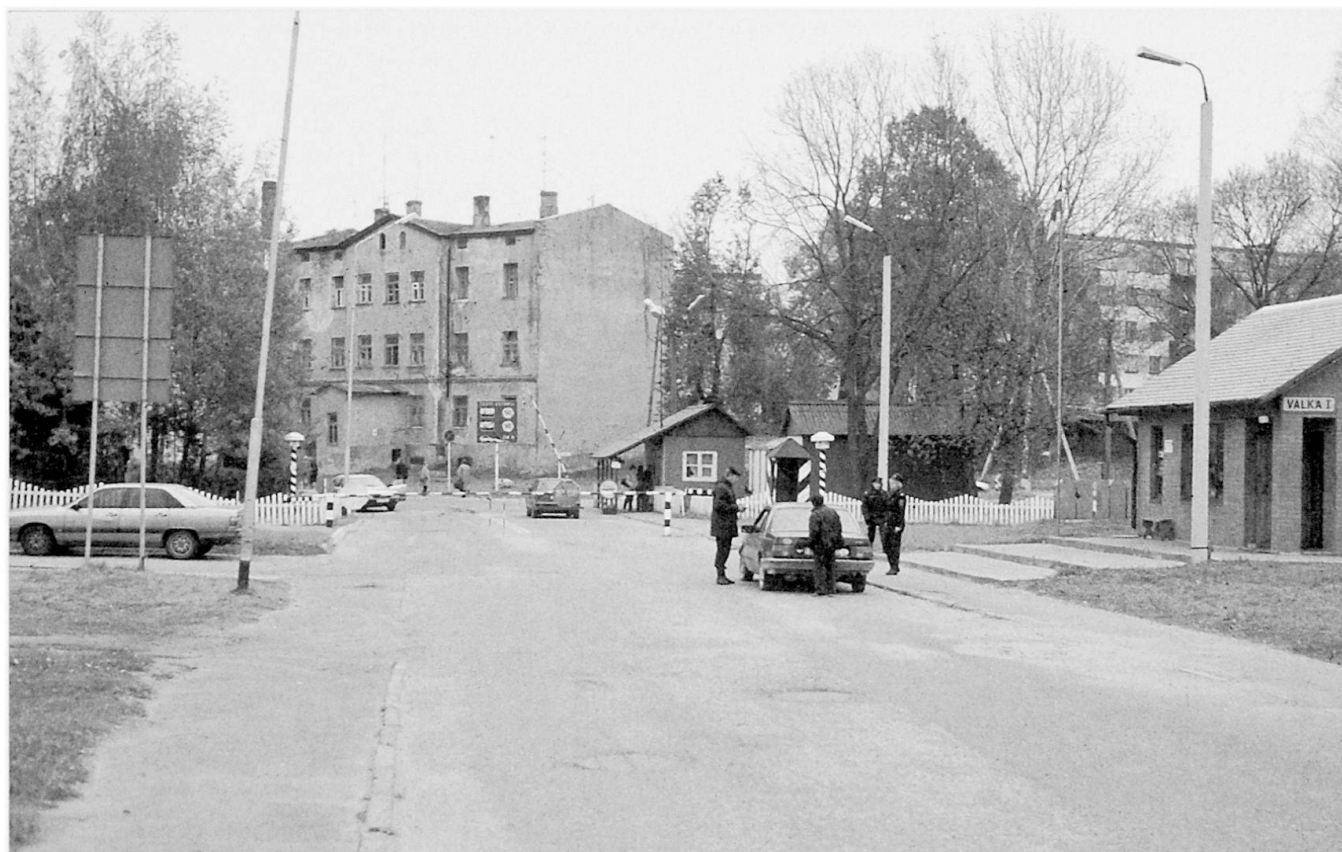
Fig. 3: The Valka/Valga border control as seen from Latvia towards Estonia, before the new EU arrangements Der Valka/Valga-Grenzposten von Lettland aus gesehen in Richtung Estland, vor den EU-Vereinbarungen Le poste-frontière de Valka/Valga vu de la Lituanie vers l'Estonie avant les accords de l'UE

Orthodox Church and Catholic Cathedral. On the other hand, several graveyards from Soviet times are located in Valka, with graves of ethnic Estonians, Russians and other nationalities. Before independence in 1991, it was quite common that both sport schools and sport clubs had members from both sides of the border. Today, Latvian pupils use to some extent the sport arena and the swimming pool in Valga. Besides language barriers and visa difficulties, border waiting time is a further hindrance to freer movement, especially for the non-citizens.