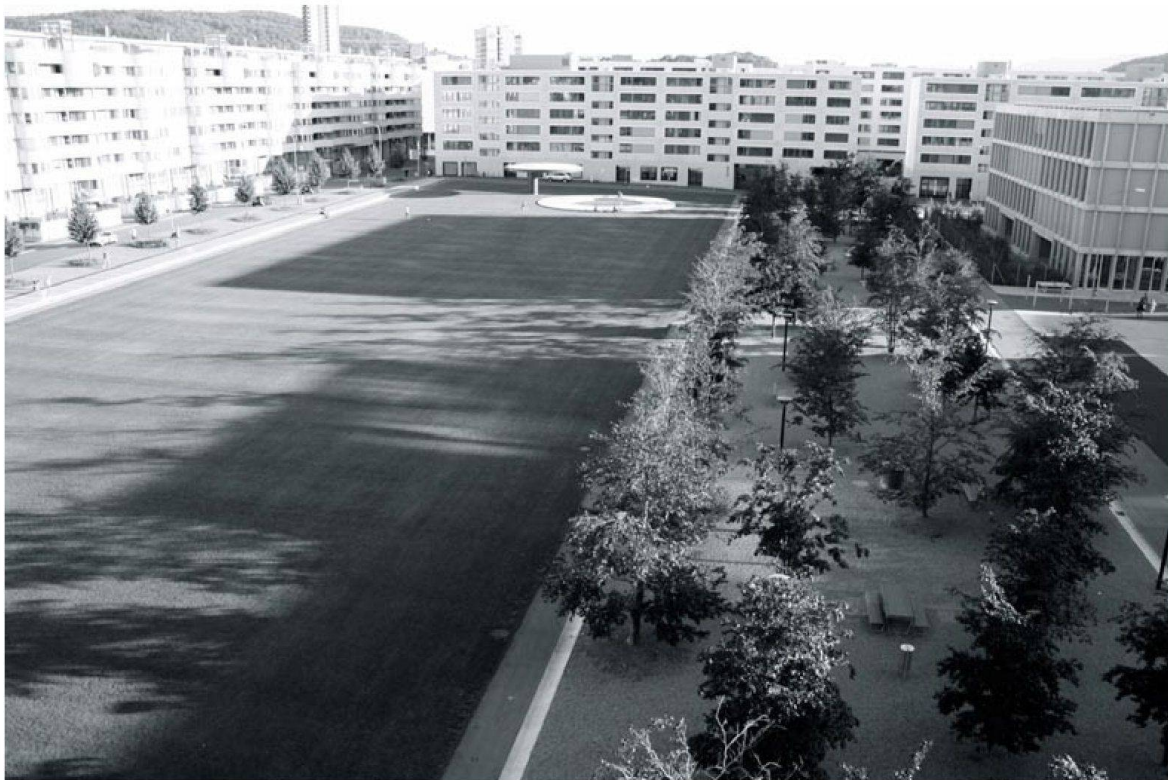
Fig. 2: Bird's eye view of Wahlenpark in Zurich (Switzerland) with the bosk on the right, the lawn in the centre, the concrete element on the left and the water basin in the background

Der Wahlenpark in Zürich (Schweiz) aus der Vogelperspektive. Auf der rechten Seite ist der Buchenhain zu sehen, in der Mitte die Spielwiese, links der Sitzbalken und im Hintergrund das Wasserbecken.