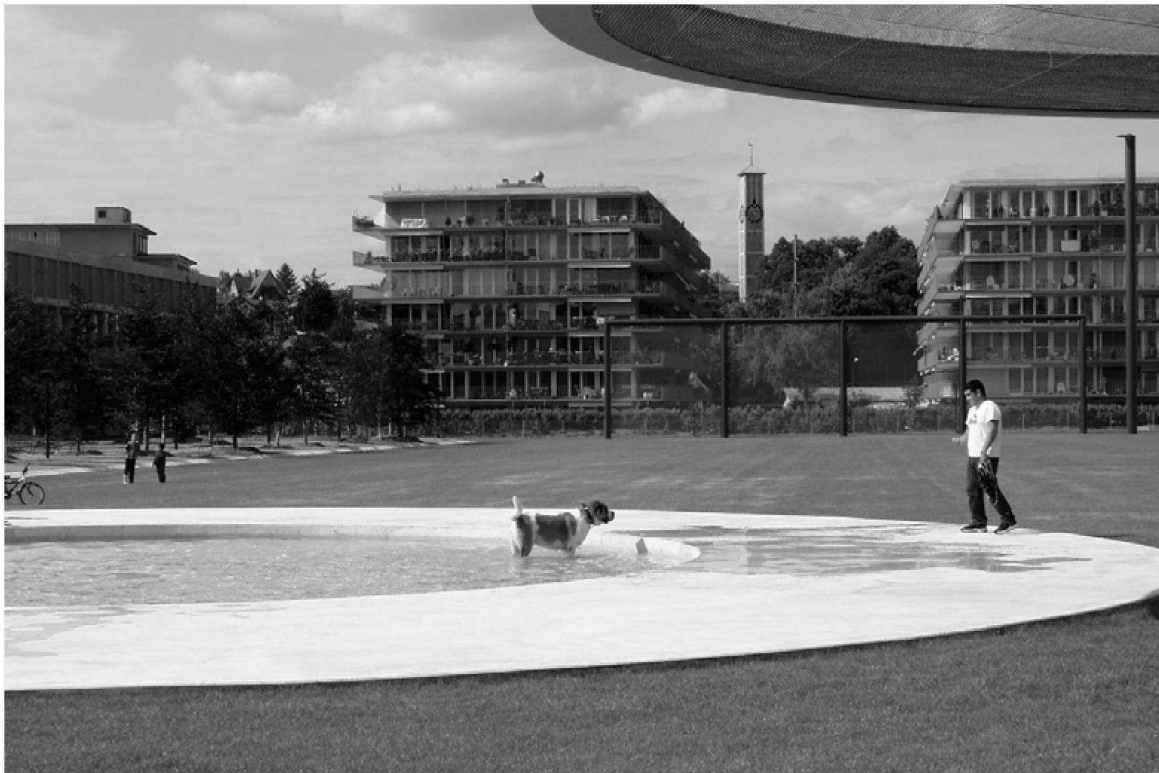
Fig. 3: Water basin at Wahlenpark with ball catch fence and flood light post in the background Das Wasserbecken im Wahlenpark, im Hintergrund das Ballfanggitter und der Flutlichtmast Le bassin du Wahlenpark avec en arrière-plan la barrière et le projecteur Photo: by courtesy of F. SCHMIT, summer 2005

In the following section, attention is given to the ways people sojourning at Wahlenpark deal with these opportunities – what kinds of spaces do park users produce?