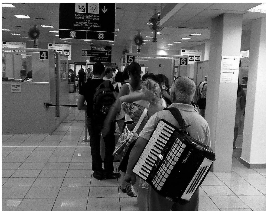
Fig. 2: The Schengen border in Larnaca, Cyprus Die Schengen-Grenze in Larnaka, Zypern La frontière de l'espace Schengen à Larnaca, Chypre

factors that contribute to migration, and the interactions between these factors. For this reason we have contributed to research on the history of immigration in Switzerland (PIGUET 2009a), the geographical distribution of asylum seekers in Europe (EFIONAYI-MÄDER 2005), the migration of football players (POLI 2004) and sex-workers (THIÉVENT 2010a, b), and the migration intentions of students in West Africa. We have also recently developed a new focus on the effects of global warming on migration. These issues are studied through the use of case studies (including Bolivia, Iran, Niger and Peru), as well as from a theoretical and epistemological perspective (PIGUET et al. 2011). The IGG's research on this topic will contribute to the IPCC's fifth report on the social consequences of climate change.