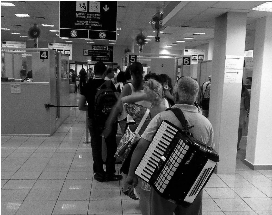
Fig. 2: The Schengen border in Larnaca, Cyprus Die Schengen-Grenze in Larnaka, Zypern La frontière de l'espace Schengen à Larnaca, Chypre

factors that contribute to migration, and the interactions between these factors. For this reason we have contributed to research on the history of immigration in Switzerland (PIGUET 2009a), the geographical distribution of asylum seekers in Europe (EFIONAYI-MÄDER 2005), the migration of football players (POLI 2004) and sex-workers (THIÉVENT 2010a, b), and the migration intentions of students in West Africa. We have also recently developed a new focus on the effects of global warming on migration. These issues are studied through the use of case studies (including Bolivia, Iran, Niger and Peru), as well as from a theoretical and epistemological perspective (PIGUET et al. 2011). The IGG's research on this topic will contribute to the IPCC's fifth report on the social consequences of climate change.