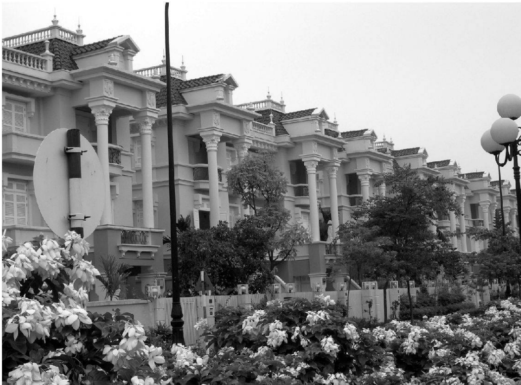
Fig. 3: The gated community as a recently introduced urban type in Hanoi, Vietnam Eine geschlossene Wohnanlage als kürzlich eingeführter städtischer Siedlungstyp in Hanoi, Vietnam La communauté fermée: un nouveau type d'habitat urbain à Hanoi, Vietnam Photo of Ciputra Hanoi International City

tices have been following this trend with traditional-modernist approaches being supplanted by models of city planning geared towards the attainment of greater sustainability (CROT 2010b; RYDIN 2010). Not all successful experiences of sustainable planning, however, get to travel. Only a few schemes have achieved such widespread recognition as to be replicated by several municipalities across the world. Our research bears on the global mobility of one such «frequent flyer» scheme, known as One Planet Living, and on the politics of its adoption by local authorities before and upon touching ground in host cities (CROT 2012). The evidence drawn from our case studies – set in Abu Dhabi and San Francisco – emphasises the complex dynamics of policy mobilities and reinforces previous findings regarding the importance of the political games and conditions that underpin transferring processes (CROT 2010c, 2011).