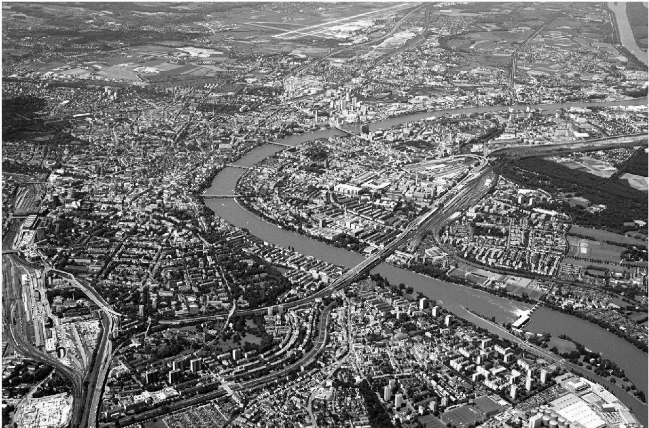
Fig. 4: Many studies at the University of Basel focus on regional economic and spatial development in the trination border region of Basel, Switzerland

Studienfokus auf regionaler Wirtschaftsentwicklung und Raumplanung im trinationalen Grenzraum Basel