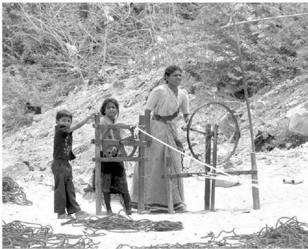
Fig. 6: Micro enterprises in the informal sector: rope production, Bhuj, Gujarat/India Mikrounternehmen im informellen Sektor: Produktion von Sisaltauen, Bhuj, Gujarat/Indien Micro-entreprises du secteur informel: production de cordes, Bhuj, Gujarat (Inde)

policy holders are finally forced to use the insurance funds not for replacing losses but for repaying immediate debt burdens. Insured households, in such situations, may not be better off in the event of damage than uninsured households, due to inefficient delivery channels, both governmental and non-governmental.