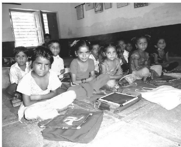
Fig. 5: Using education as a tool to rehabilitate poor and vulnerable children: public primary school in rural India, Anandpura, Gujarat/India

Grundschulbildung als Instrument der Eingliederung benachteiligter Kinder im ländlichen Indien, Anandpura, Gujarat