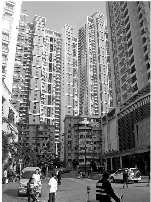
Fig. 3: Architectural contrasts and social disparities in urban China: Xiadu Urban Village in Guangzhou (in the foreground), modern urban riverside development (in the background)

Städtebauliche und soziale Gegensätze im Stadtbild: Xiadu «Urban Village» inmitten von Guangzhou (im Vordergrund), moderne Wohnanlage in Hochbauweise an der Uferpromenade (im Hintergrund)