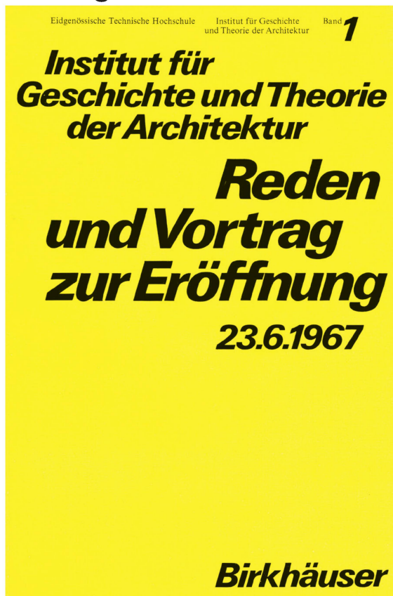
fig.1 Hans-Rudolf Lutz, cover of the first volume in the gta series, 1968.