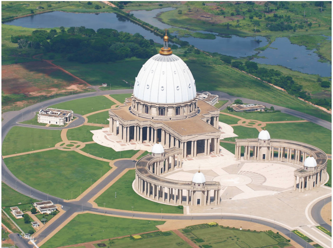
fig.1 Aerial view of Yamoussoukro's basilica, Côte d'Ivoire.

The basilica was sharply criticized in the media worldwide. Some called it an obscene gesture of waste in a country suffering from poverty. fig.2 Moreover, the project was carried